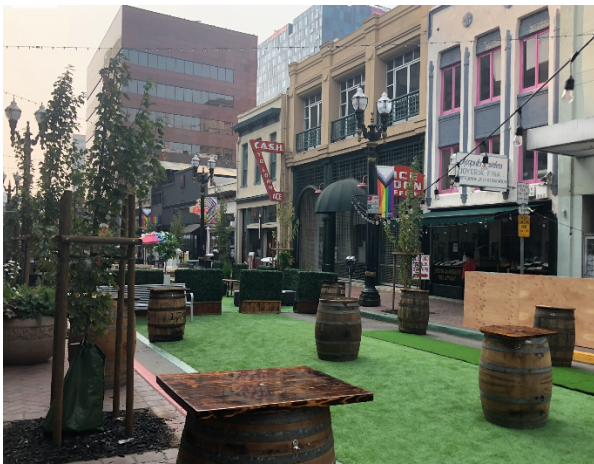
Al Fresco street closure in San Jose CA