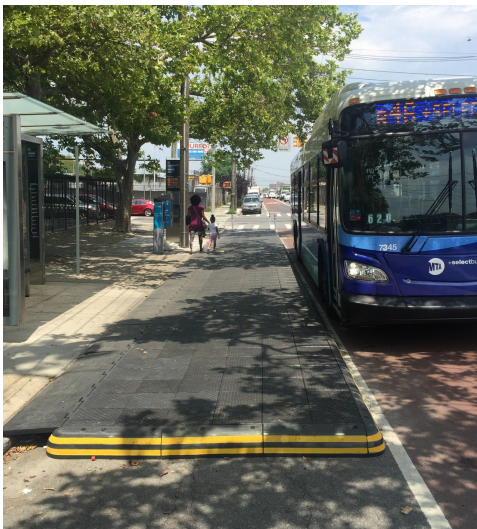
Extended bus ramp in Brooklyn, NY StreetsBlog USA