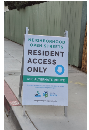
Slow Street sign in Long Beach CA