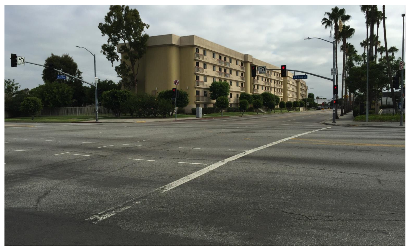
VERY WIDE ARTERIAL STREETS PRESENT CHALLENGES FOR PEOPLE CROSSING

The major thoroughfares through the neighborhood are Crenshaw Boulevard and King Boulevard both wide streets with high traffic volumes and 4-6 lanes. The current street configuration prioritizes the movement of automobiles in accordance with the Los Angeles Mobility Plan 2035. However, the Mobility Plan also designates sections of Crenshaw Boulevard as a transit and pedestrian priority street and encourages the following implementation of street improvements to foster walking and transit use. Despite these designations, the current street configuration presents many challenges for people walking and taking transit in the neighborhood, including long crossing distances, lack of curb extensions, lack of pedestrian safety islands, and faded crosswalk markings.