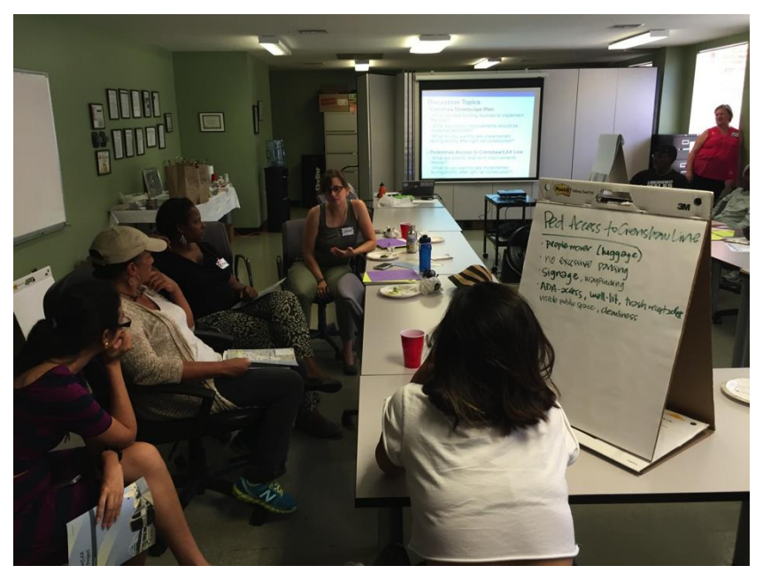
PARTICIPANTS ENGAGED IN ACTION PLANNING DISCUSSION TO IMPROVE PEDESTRIAN ACCESS TO THE CRENSHAW/LAX LIGHT RAIL LINE

tree to mature and provide a shady canopy.