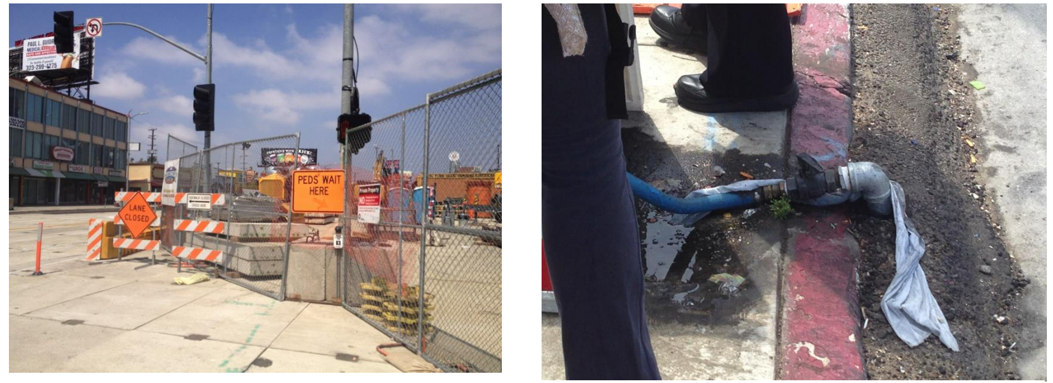
CONSTRUCTION ACTIVITIES NEGATIVELY IMPACTING PEDESTRIAN MOBILITY AND CONTRIBUTES TO SENSE OF NEIGHBORHOOD NEGLECT

Construction Barriers & Quality of Life Impacts: Participants directly observed the impacts of the Crenshaw/LAX light rail line construction on pedestrian mobility, access, and circulation through the neighborhood during the assessment, including exposed water pipes on Crenshaw Boulevard between King Boulevard and Stocker Street that made walking challenging. Additionally, the east side of Crenshaw Boulevard was closed around the construction area for the station, though signage and a temporary path were provided. Participants noted the lack of construction signage and clear delineation of spaces contributed to a chaotic environment, as well as commonplace neglect through littering and dumping in the construction zone.