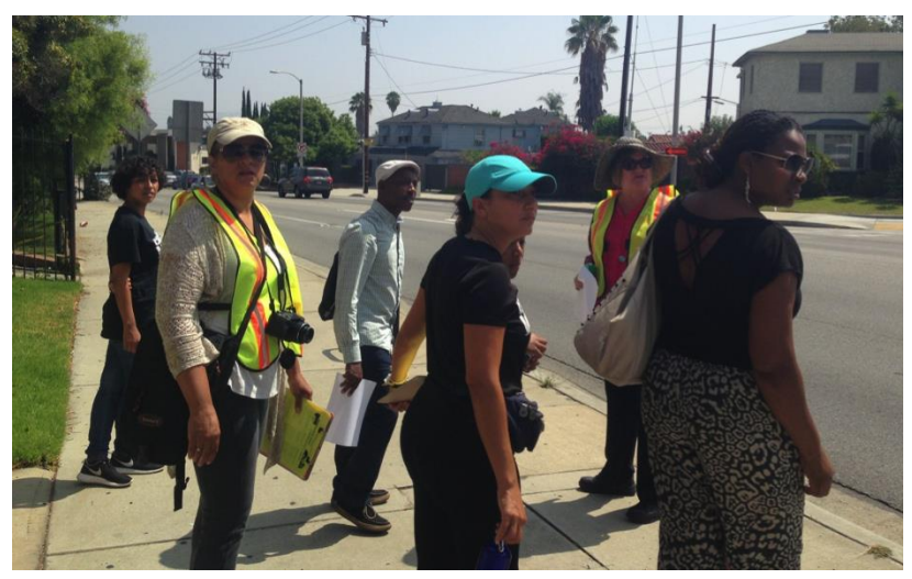
identify positive community assets and strategies which can build upon these assets.

Walkability assessments were conducted along major streets including Crenshaw Boulevard and King Boulevard, as well as minor streets, such as Stocker Street, Degnan Boulevard, Santa Rosalia Drive, and Marlton Avenue. Participants were asked to 1) observe infrastructure conditions and the behavior of all road users; 2) apply strategies learned from the 6 E's presentation that could help overcome infrastructure deficiencies and unsafe driver, pedestrian, and bicyclist behavior in Crenshaw/Leimert Park; and 3)