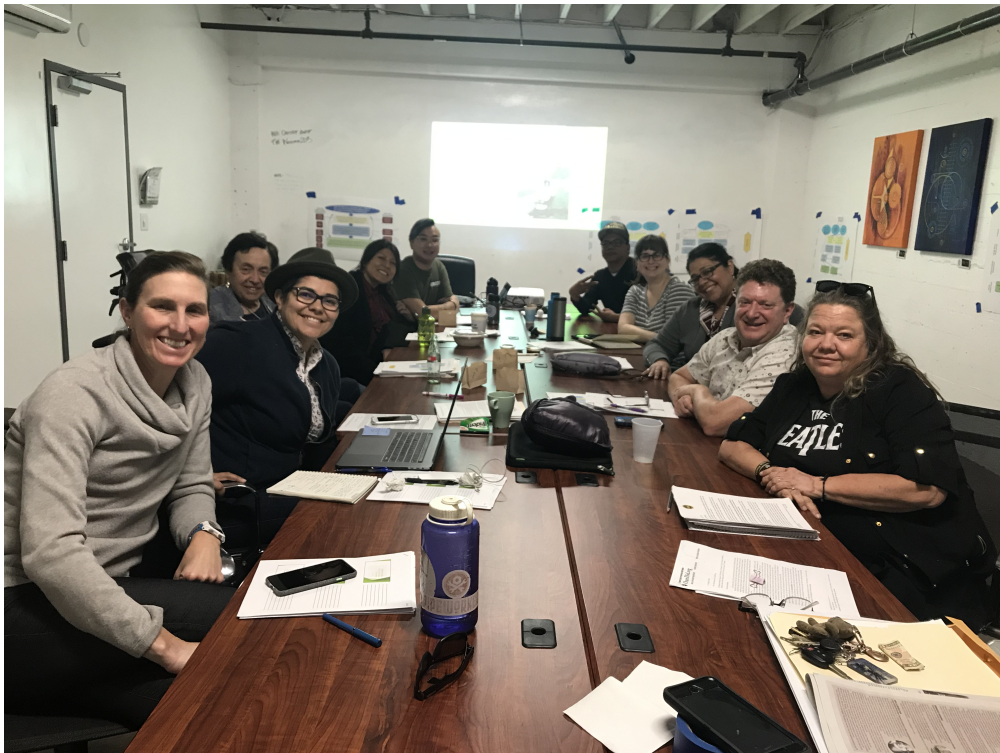
Greetings from the Cal Walks Board of Directors!

You may have already noticed a few changes on our new website ( www.calwalks.org ), but we're still super excited to officially share our new look with you! We've made it easier than ever for you to stay connected to the latest updates on active transportation policy and legislation and have pooled together our staff's expertise into a handy Resource Library , including a dedicated guide to Navigating the Active Transportation Program (ATP) . Beyond a simple visual refresh, we also wanted to take this opportunity to share with you our new vision, core values, and guiding principles that are key for achieving the transformative change we wish to see in our transportation system.