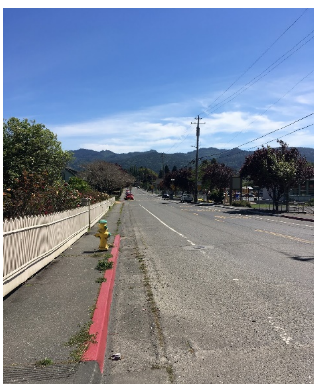
Faded markings along Greenwood Road near Blue Lake Elementary.

Worn and faded street markings, including lane markings, crossings, stop bars, centerlines, and signage were observed. Visible lane markings are critical for areas with no sidewalks and where pedestrians and bicyclists must use the shoulder of the road to travel. Clearly delineating the space for vehicles, bicyclists, and pedestrians is recommended. Restriping of faded road markings, including lane lines, bike lanes, directional signage is recommended as well as crosswalk and high-visibility crosswalks near the School and major pedestrian routes. Many residential streets in Blue Lake are heavily used by pedestrians to access various amenities. Cal Walks staff observed a lack of crossings along streets with pedestrian activity