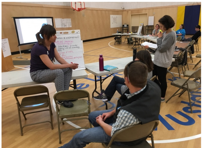
Participants engaged in small group action-planning discussions.

Workshop participants provided the following recommendations to improve pedestrian and bicyclist safety in the City of Blue Lake: