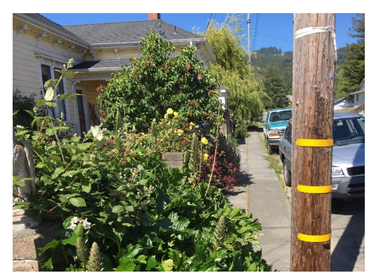
Overgrown vegetation and an electricity pole create sidewalk obstructions.

Vegetation, including shrubs and trees can add to the aesthetic of a streetscape, but unmaintained vegetation can reduce visibility of and for road users, as well as limit the usability of existing sidewalks. In several instances, Cal Walks staff observed overgrown vegetation reducing visibility around corners and reducing the traveling space for pedestrians.