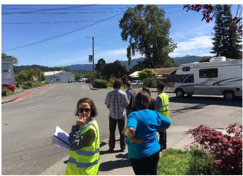
Participants analyzing conditions during walk/bike assessment.

• Ambiguous & Inadequate Bicycle Infrastructure: The purpose of the edge striping along Greenwood Road is ambiguous, with participants believing the space to be designated as either a parking lane or a bicycle lane. Participants agreed that clarifying the lane's purpose as either a bicycle lane or parking lane is a low-cost action step the community should take. Additionally, participants noted that the City's single clearly marked bicycle lane on Hatchery Road is inadequate given the high level of conflict between weekend bicyclists and freight trucks that frequently cut across the bicycle lane.