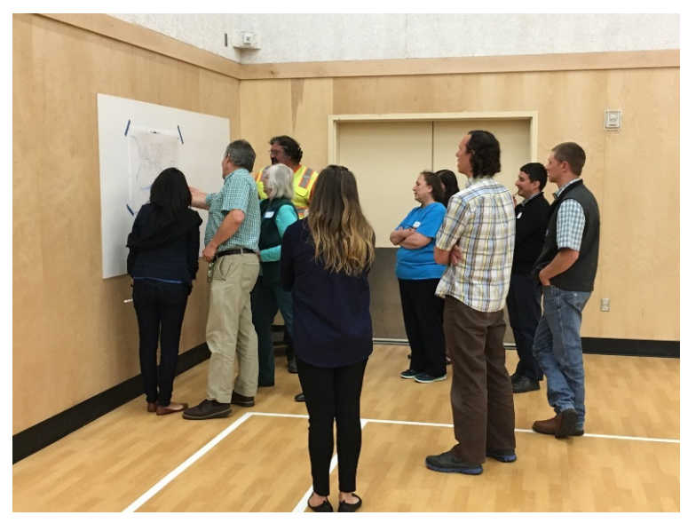
Participants gather for data crowdsourcing activity.

The Humboldt County Safe Routes to School (SR2S) Task Force does collect qualitative data through parent surveys on an annual basis. According to the Fall 2016 parent survey, only 2% of students walk to school and 4% bike to school, despite 44% of students living less than 1 mile from the school. 5% of students walk home from school, and 5% bike home from school. For those parents that do not allow their child to walk or bike to/from school, 55% of respondents cited distance and the speed of traffic along the route as having affected their decision.