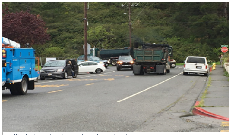
Traffic during school arrival at Blue Lake Elementary.