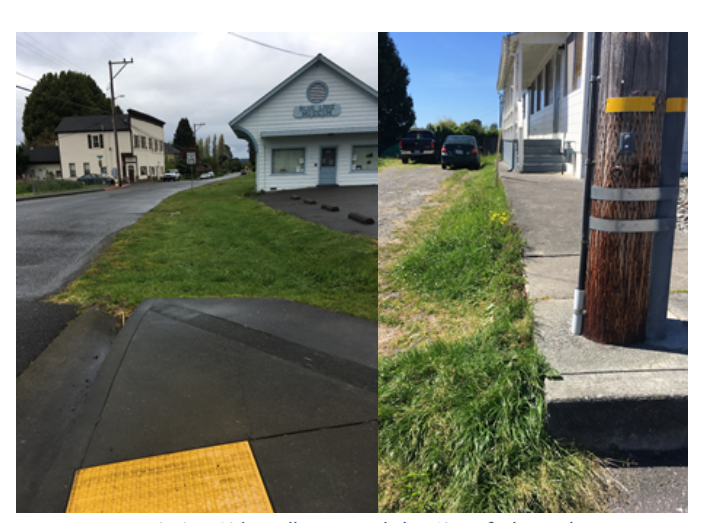
Missing Sidewalks around the City of Blue Lake.

Sidewalks provide physical separation for people walking from vehicle traffic and are a critical component for pedestrian safety, especially for students walking to/from Blue Lake Elementary School and residents walking their dogs, traveling to downtown businesses, or going to city parks. During our site visit, Cal Walks staff observed areas throughout Blue Lake with missing or discontinuous sidewalks, including sections of Railroad Avenue, South Railroad Avenue, the north side of Blue Lake Boulevard (which is County-owned), Chartin Road, H Street, 1street, and Hatchery Road. Where sidewalks were present, they were often narrowed by utility poles or encroaching vegetation and ranged from various widths. Lack of drainage along