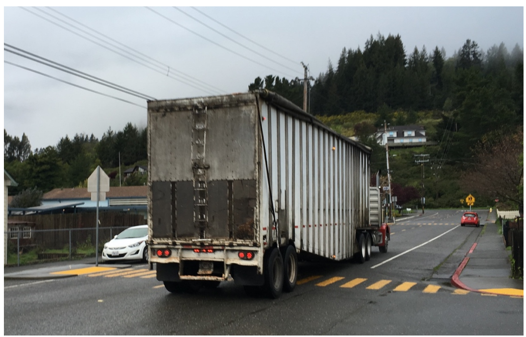
Freight truck traveling along Greenwood Road during school hours.

• Ambiguous & Inadequate Bicycle Infrastructure: The purpose of the edge striping along Greenwood Road is ambiguous, with participants believing the space to be designated as either a parking lane or a bicycle lane. Participants agreed that clarifying the lane's purpose as either a bicycle lane or parking lane is a low-cost action step the community should take. Additionally, participants noted that the City's single clearly marked bicycle lane on Hatchery Road is inadequate given the high level of conflict between weekend bicyclists and freight trucks that frequently cut across the bicycle lane.