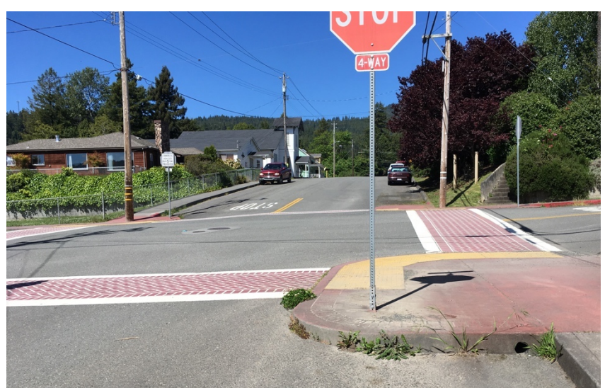
Decorative crosswalks and curb extensions in Downtown Blue Lake

Participants were asked to 1) observe infrastructure conditions and the behavior of all road users; 2) apply strategies learned from the 6 E's presentation that could help overcome infrastructure deficiencies and unsafe driver, pedestrian, and bicyclist behavior around Blue Lake; and 3) identify positive community assets and strategies which can be built upon. Following the walkability and bikeability assessment, the participants shared the following reflections: