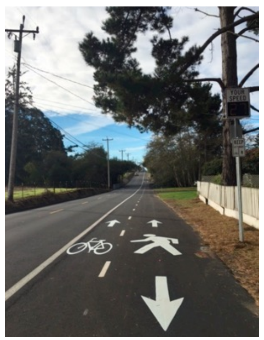
Example of enhanced shoulder for pedestrians and bicyclists using temporary materials in McKinleyville, CA.

California Walks and SafeTREC also submit the following recommendations for consideration by the City of Blue Lake: