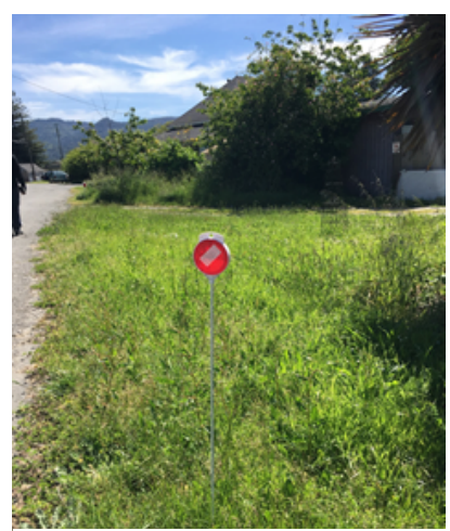
A small light reflector on the side of the road.