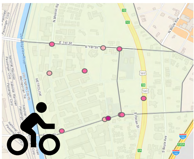
Figure 2: Bicycle Injury Collisions (2014-2018)

Collision Severity (2014-2018) ● Fatal 1 ● Injury (Other Severe) 7 ● Injury (Complaint of Pain) 4